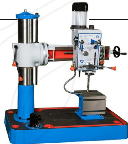
Table size - 1160 x 650 x 600 Bt 40, Spindle rpm - 10000 with oil cooler unit. Machining accuracy less than 0.01 mm machine year 2024 Made in INDIA.